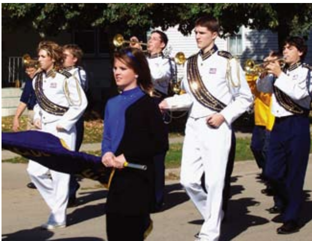
LEFT: The Cascade High School Marching Band in the annual Homecoming parade.