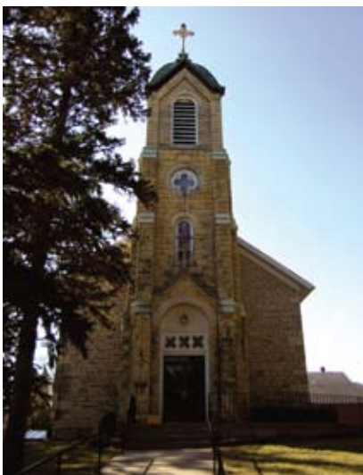
BELOW: St. Peter's Church at Temple Hill, and the Community Presbyterian Church in Cascade.