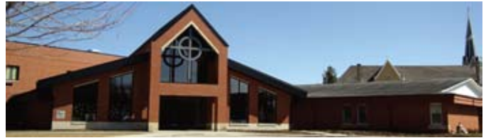
BELOW: Aquin Elementary School.