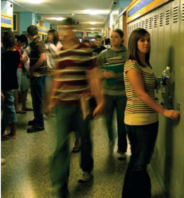
LEFT: Students bustle through the corridors between classes at CHS.