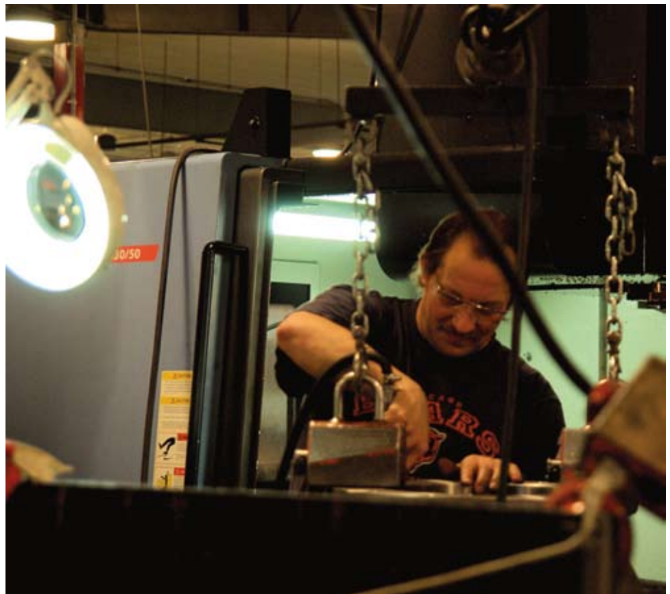
RIGHT: Industry has blossomed in Cascade in recent years, making manufacturing jobs a major part of daily life.