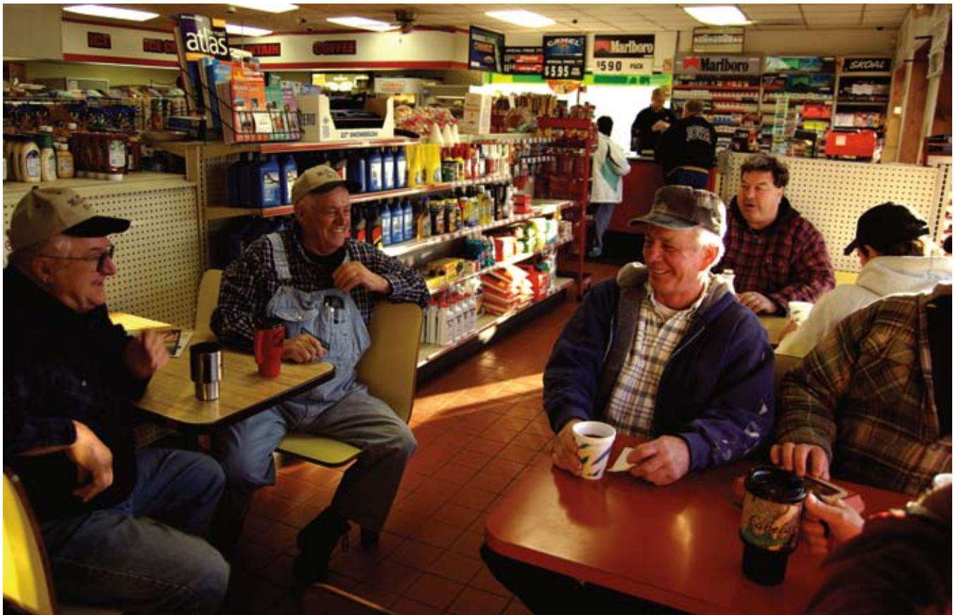
ABOVE: Each morning, coffee groups form throughout town. This group occupies the booths at McDermott Oil.