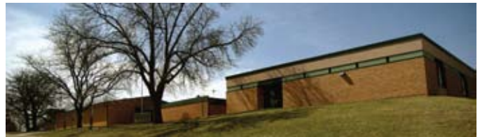
ABOVE: Cascade Elementary School.