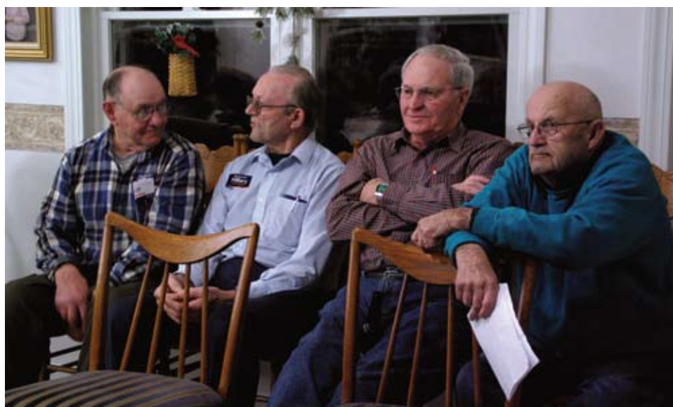
BOTTOM: Residents gather in a local farmhouse to take part in Iowa's first-in-the-nation caucuses.