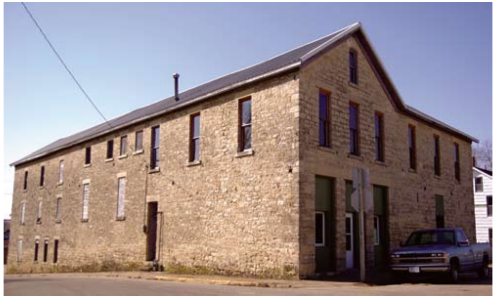
RIGHT: The Mays Brewery building, built in 1872, today has a more philanthropic life as the area's food pantry.