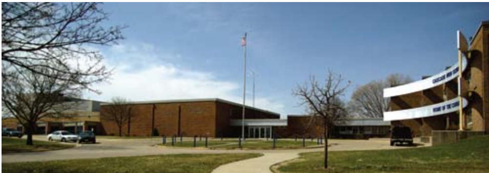
LEFT: Cascade Junior-Senior High School.